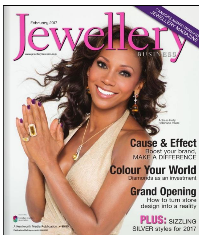
Holly Robinson Peete wearing pieces from the 2016 Summer AGTA Spectrum Awards™ collection seen in Jewellery Business, February 2017