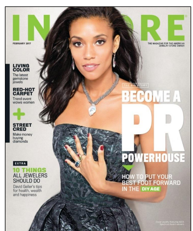
Annie Ilonzeh wearing pieces from the 2016 Summer AGTA Spectrum Awards™ collection seen in Instore Magazine, February 2017