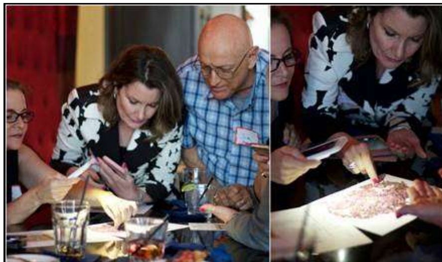
Event attendees studying the Ruby rough from Burma